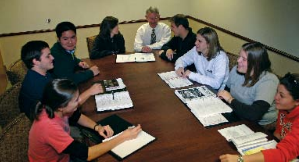
The CASNR student success center offers a multimedia conference room to provide space for student organizations, like the Ag Ambassadors, to discuss business.

Sponsors can become annual or lifetime sponsors. Those businesses, organizations or individuals who contribute to the success center are recognized on the CASNR Web site and are showcased in the entrance of the center.